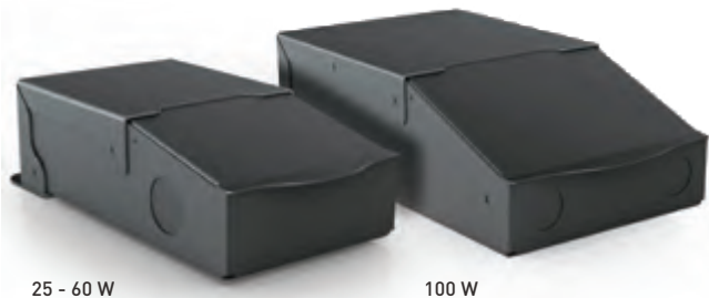
25 - 60 W